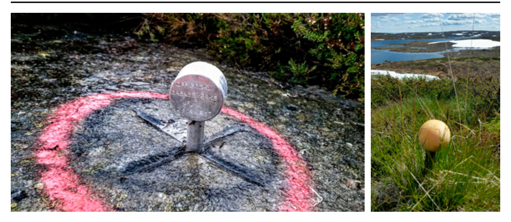
Figures 3a-b. Norwegian boundary marks. Figure 3a. Chiselled cross in rock renewed with standard aluminium boundary mark was first introduced in 1980. Figure 3b. Iron pole with plastic hat used by the public roads administration.

In some cases, boundary marks are purposefully placed some distance away from the actual boundary point. This can be due to natural constraints, e.g., for boundaries along lakes and rivers. However, it is also done for procedural reasons, or for practical reasons that may not be obvious from the terrain. Such boundary marks are sometimes referred to as marked 'for measurement' ('på utmål'), typically with the understanding that the boundary line extends in a straight line from the marking to the actual boundary point. This point may not be exactly determined, or it may be demarcated by separate, older or newer, boundary marking. It is necessary to consult the archival evidence, such as the protocol of the marking process, to interpret the meaning of these boundary marks.