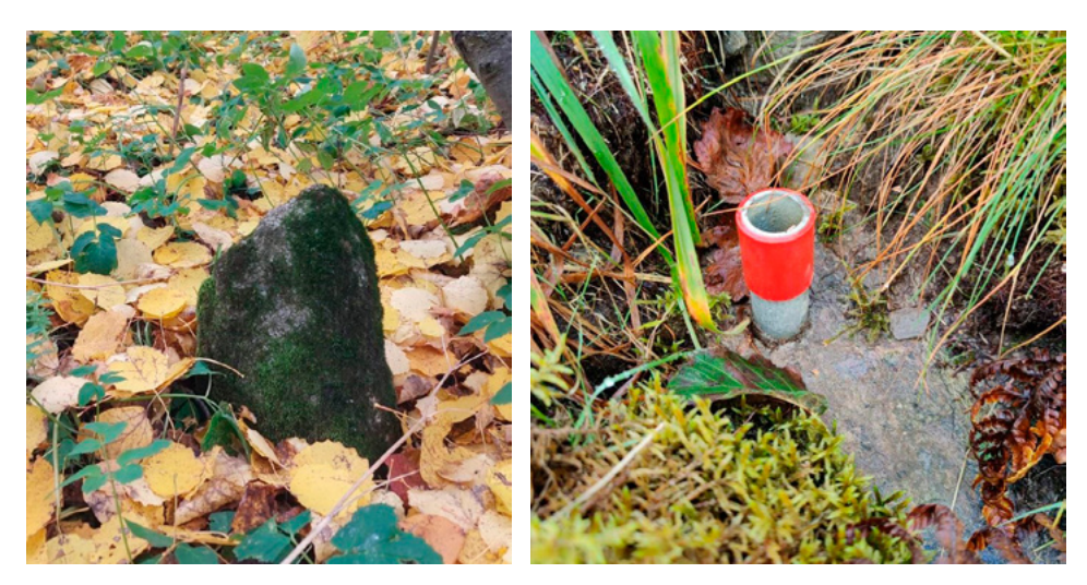
Figures 5a-b. Swedish boundary marks. Figure 5a (left). An erected natural stone. Figure 5b (right). A modern iron pole with a red top, placed in bedrock.

dossier. It is also possible to establish eccentric markings, i.e., not placed on the boundary line. These auxiliary markings are intended to be of help in identifying an unmarked boundary point. Boundary markings in woodland areas are placed in a way that property owners easily can remove vegetation obstructing the line of sight between them (Lantmäteriet, 2019).