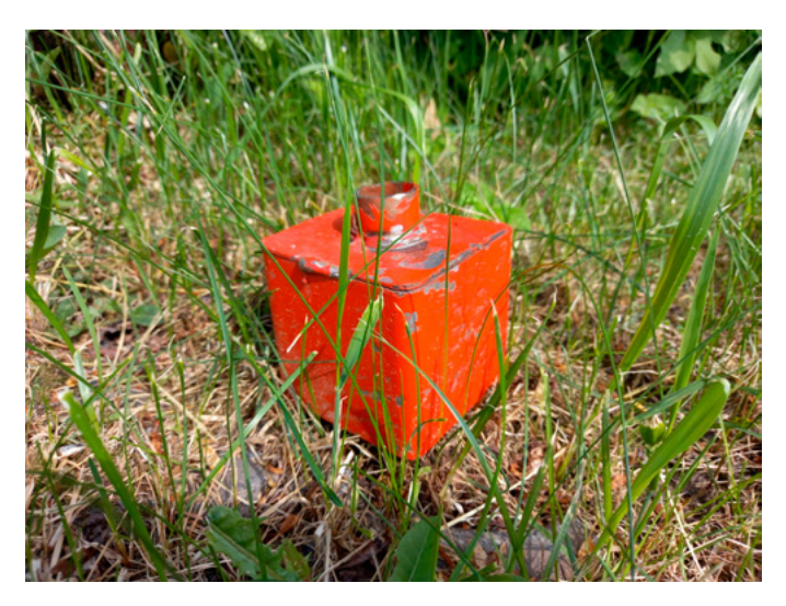
Figure 2. Finnish boundary mark.

boundary between villages in the middle (REFA (1995), NLS (2022), Laki (1902). In minor brooks etc., also the property boundary typically runs in the middle. Particularly in the coastal areas in the West, the land uplift (5–10 mm/year, i.e., 0.5-1~{\rm m} / 100 years) plays a significant role because the boundary between land and water or the reliction area runs where the shoreline was when the local basic land consolidation was carried out. (NLS, 2022). These land consolidation processes took place mostly in the 1700s and 1800s. A natural boundary is fixed and remains at its original place, even if the location of the physical phenomenon which it has followed changes. A ditch, a brook, or a river can change its course, but the property boundary does not follow. To localise the original place of such a boundary, you must use old maps, aerial imagery, or marks in the field.