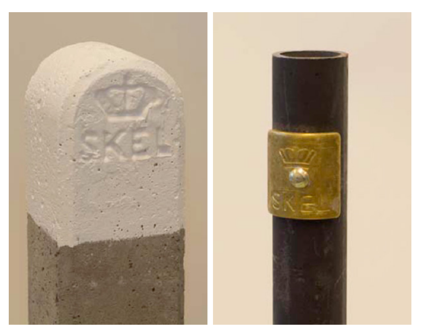
Figures 1a-b. Danish boundary marks. Figure 1a (left). Concrete pillar with white top, royal crown, and the word 'SKEL'. Figure 1b (right). Iron tube with brass plate, royal crown, and the word 'SKEL'.

Where natural stone was often used for marking in earlier times, then for most years, the marks used have been approved and manmade. The general rule