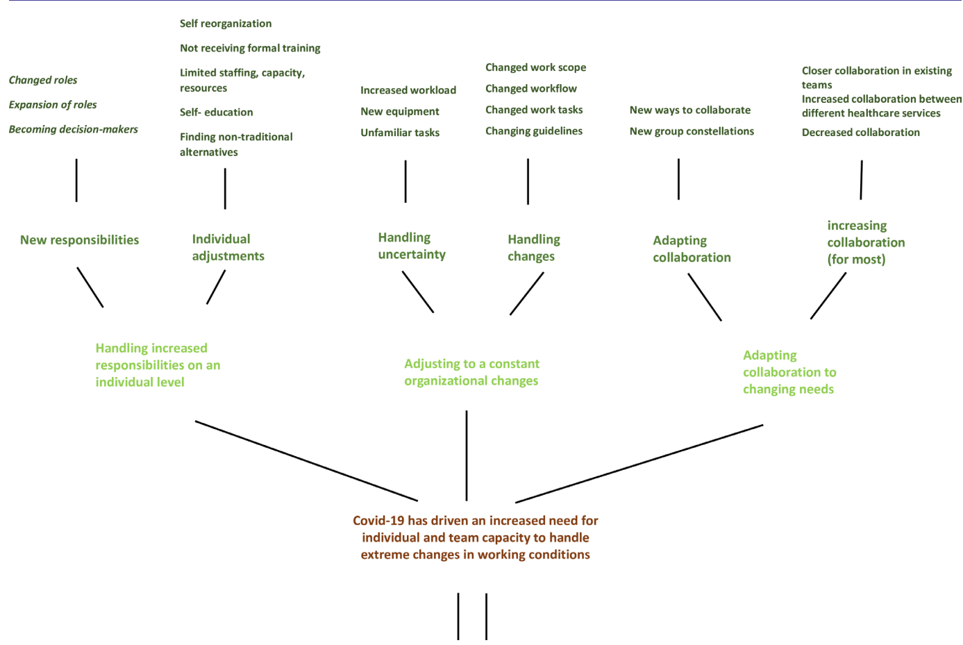
Figure 1 Example of analysis theme 1, steps 1–3.

as well as creating new collaborations, to handle changing needs.