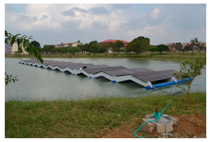
Figure 2. Floating solar photovoltaic (PV) demonstration plant.

Consequently, an FPV DP with a 46-kW capacity (in a pond) and a 5-kW stand-alone reference plant (on land) was launched at the University of Jaffna in northern Sri Lanka (Figure 2) in early 2020. The Norwegian energy group Equinor AS in conjunction with Innovation Norway, a state agency promoting innovation and industry development, provided