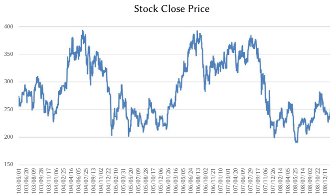
Fig. 2. The closing price of the stock used in the experiments.

As for the stock price series, according to the time interval of the news, the time interval of our stock acquisition extends from May 1, 2014 to January 30, 2020, and the data was collected from the Taiwan Stock Exchange. The closing price of the stock used in this study is shown in Fig. 2.