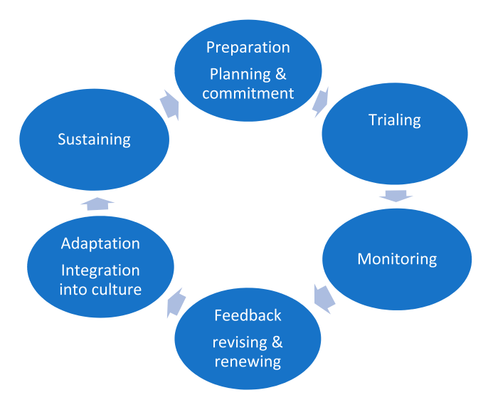
Figure 1. The Implementation Cycle in the Case Kindergarten.

The implementation of the change involved a cycle of actions (Figure 1) that were constantly refined. The headteacher adopted an approach in which they could try out ideas in a developmental matter. The implementation cycle started with the logistics of preparing to hire a chef. Due to the long hiring process, a substitute was recruited to work in the kitchen. The first trial with the substitute lasted for around four months and was not very successful. After closely monitoring and reflecting on the process, the headteacher noted that what she initially thought were essential criteria for the position, such as having a pedagogical background, became less relevant. Instead, the competencies of budgeting and financial management, healthy meal planning and targeting available money effectively were found to be more important. Therefore, the first trial led to a more thorough consideration of the qualifications required for the position. The