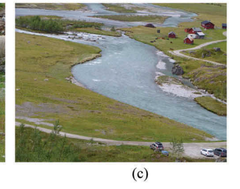
Figure 1. Examples of photographs taken by one of the boys participating in this study: (a) his hand picking berries, (b) a sleeping sheep and (c) a 'greyish' glacial stream.