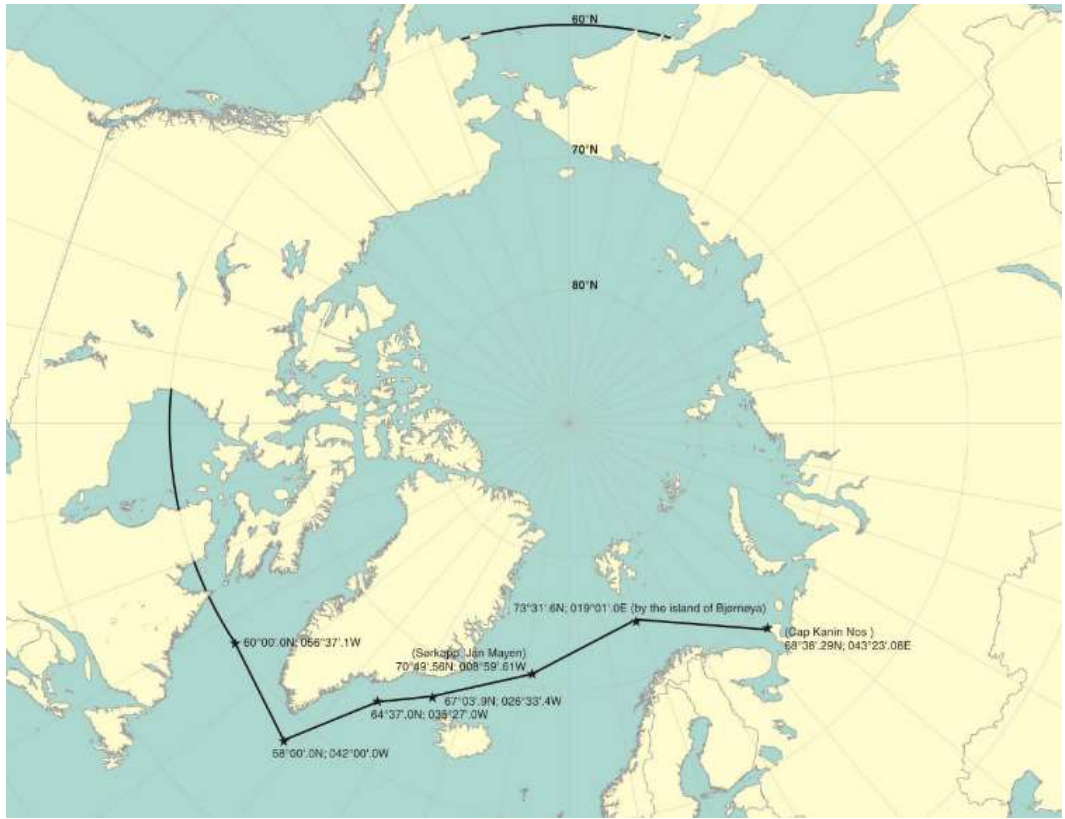
Figure 2. The Arctic area covered by the Polar Code [5].