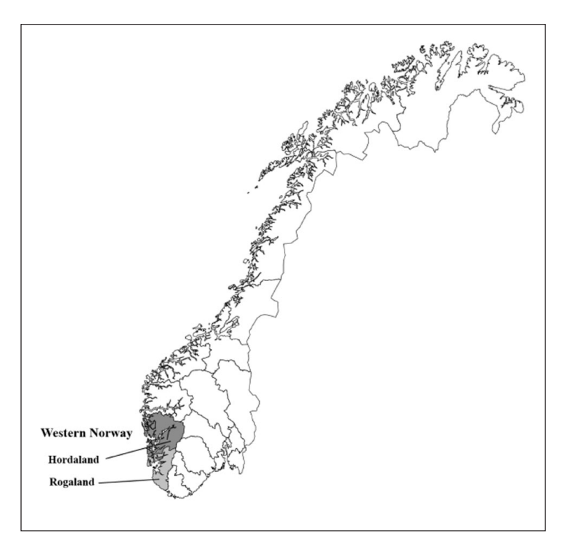
Figure 2. The case region of Western Norway.