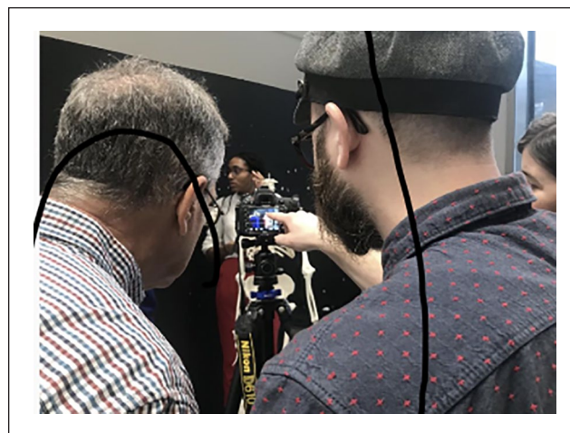
Figure 5. Cameras watching cameras glowing

SciCulture course considering how devices as co-participants and co-researchers, could be more pro-actively planned into pedagogy and research.