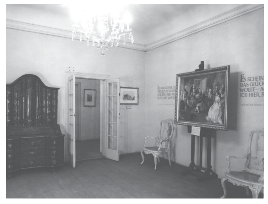
Fig. 2: Exhibition in Mozart's apartment, 1940s.

death to take care of his musical production, his personal belongings were sold by his widow in order to make ends meet. With only a few belongings still existing and the Mozart Year fast approaching, it turned out to be impossible to loan any of the few still existing personal items for a longer period. While the Internationale Stiftung Mozarteum, to which the Mozart museums in Salzburg belong, had been collecting personal items for years, Wien Museum only has three in its collections: a letter allegedly written by Mozart, a keyhole cover from one of his earlier apartments and