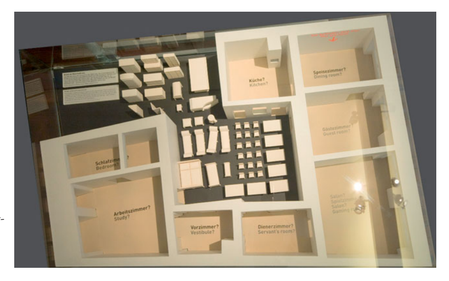
Fig. 4: Scale model of Mozart's apartment. Artist: Augustin Fischer. Photo: Mozarthaus Vienna/David Peters.

Objects in a museum acquire their meaning not only through their material quality and their original use, but through the meaning assigned to them by the curator and the visitor. Indeed, one may say that objects lose most of their original function as soon as they enter a museum's collection (Scholze 2004: 19), and in exhibitions they convey a spectrum of meaning through the juxtaposition with other objects. To any object there are attached codes and subcodes that are deciphered according to the observer's personal situation or the specific context the object is displayed in (Eco 1994: