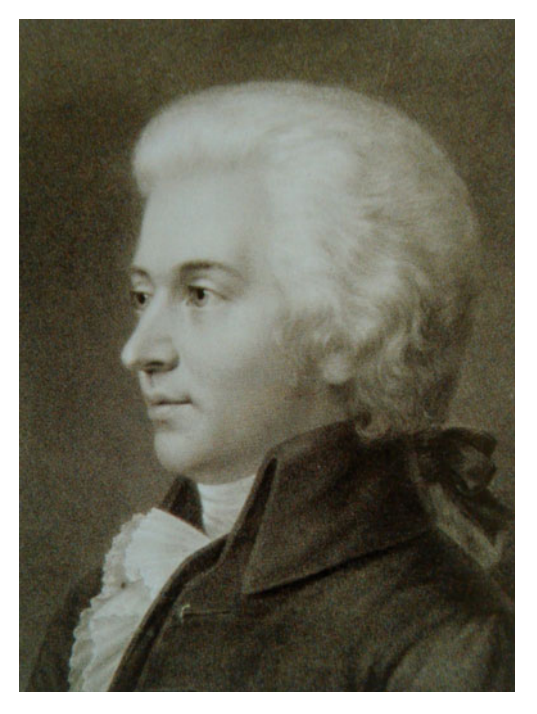
Fig. 8: "Mozart" by P. Rohrbach, 1863.

A visitor survey done by Mozarthaus Vienna in 2008 on the museum, including the two upper floors, shows that the criticism expres-