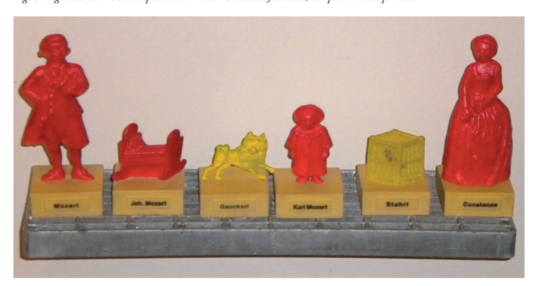
Fig. 6: Figurines in Mozart's apartment. Artist: Christian Jauernik, anaplus.

There were only very few pictures of Mozart made during his lifetime. However, there are numerous images based on some knowledge of his person or on the imaginings of subsequent generations. The major component that these pictures – mainly lithographs – have in common is their rich imagination and wide breadth in their depictions of Mozart, e.g. a lithograph made in the 1860s portrays Mozart