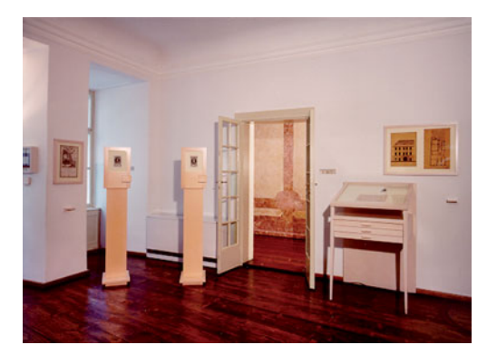
Fig. 3: Exhibition in Mozart's apartment, late 1990s.

Very little is known about the function each room had when Mozart lived there. We know with some certainty where the kitchen and the main entrance were. For anything else, we have to guess or rely on sources such as visitors' memoirs or archaeological findings. Mozart's apartment thus becomes representative of our knowledge of the past: patchy, selective and often arbitrary. In recent decades, discussions on the curator's role have critically examined his or her anonymous voice in exhibitions: the contents and the message of the exhibition tend to be represented as objective, as an authoritative truth to the visitor. Possibilities to encounter this include the naming and positioning of the exhibition's team or the active involvement of the visitor in the creation process of the exhibition, e.g. by interactive modules. Alternative approaches regard the exhibition as a performative space in which the messages the curator wishes to convey and which the visitor reads into the exhibition can never be fixed once and for all - they will always stay arbitrary to a certain extent. Werner Hanak-Lettner (2010: 105-109) speaks of the curator as an invisible team player ("Mitspieler") who provides the visitor with texts and objects. Yet the real encounter takes place