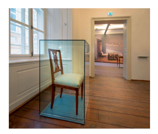
Fig. 5: Exhibition in Mozart's apartment, 2006.