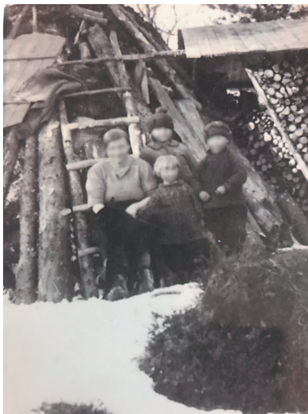
Photo 3. Well-being through connection to the family.

This participant had felt the importance of family since being a child and said: "You just know it (when