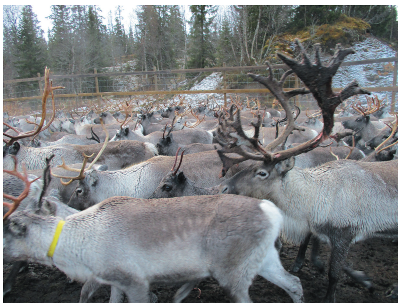
Photo 2. Well-being through connection to the reindeer.

Those who no longer had a reindeer fence where they belonged shared memories from their childhood and early adulthood when the reindeer and reindeer herding had an important role in their lives. One of the participants shared that in his view reindeer husbandry had changed due to loss of land, climate change, and the use of motorised vehicles. But, despite all these changes, “the sound of the reindeer has not changed!” Hearing the