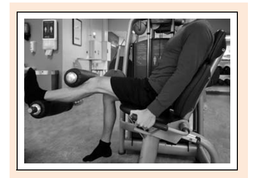
Figure 3. Positioning during the leg curl maximum voluntary isometric contraction for the biceps femoris muscle.

In accordance with previous studies and recommendations (Hermens et al., 2000; Saeterbakken et al., 2019), the recorded EMG amplitudes (average across three repetitions) during the dynamic tests were normalized to the respective values collected during the maximum voluntary isometric contraction (MVIC). The MVIC EMG activity was measured with the machines fixed in a 1) 90° knee angle in the knee extension machine for the vastus lateralis, vastus medialis and rectus femoris (Pincivero et al., 2004), 2) 150^{\circ} hip angle ( 180^{\circ} = full extension) in the kickback machine for the gluteus maximus, and 3) 170° knee angle in a leg curl machine (Technogym Selection; Cesena, Italia) for the biceps femoris (Kellis et al., 2017) (Figure 3). The joint angle during the gluteus maximus MVIC was chosen because 150° was the greatest common angle that could be tested dynamically during both kickback and leg press. Three attempts were given in each exercise with two minutes rest between. The MVIC EMG was recorded while exerting maximal force for five seconds, of which the mean of the three seconds with the highest EMG amplitude from the best attempt was used for normalization (Saeterbakken et al., 2019). The normalization was performed by dividing the average EMG amplitude across three repetitions by the recorded MVIC EMG and multiplying by 100 ((dynamic EMG / MVIC EMG) × 100).