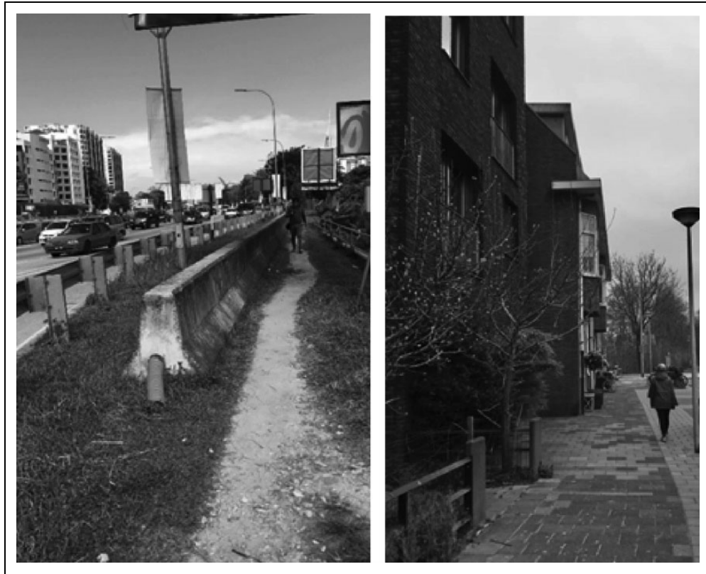
Figure 1. Illustrative context for scenario 1 (left) and scenario 2 (right).

being applied 61 times of a total of 301 (e.g., Currie et al. 2009; Currie 2010; El-Geneidy et al. 2016; Jaramillo, Lizárraga, and Grindlay 2012; Kwan 1999; McCray and Brais 2007; Pyrialakou, Gkritza, and Fricker 2016; Schwanen, Kwan, and Ren 2008). This can be attributed to spatial data collection and analysis techniques being previously unfeasible before the 1980s. This presents a challenge and opportunity to fill the knowledge gap on how the interplay between spatial conditions and sociocultural constructs in combination with intrinsic factors influences mobility inequality.