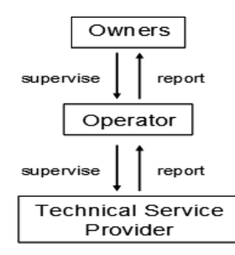
Figure 1: Main actor groups and their inter-organizational relationship

The data presented in this paper originate from a study of ethnographic character. One of the authors followed a specific upgrading project within two gas processing plants in Norway during a two-and-a-half-year period. EU requirements from 1998 [15], resulted in a reorganizing of the Norwegian petroleum sector in a way that ensures independency within the gas-value-chain and secures third-party access to the infrastructure for transportation of natural gas to the market. This new requirement resulted in a separation of ownership and operatorship along the gas-transportation value-chain. In some cases, the operatorship has also outsourced daily operations to a technical operator company (TOC). The inter-organizational collaboration between the actor groups in the project under study is described in Figure 1.