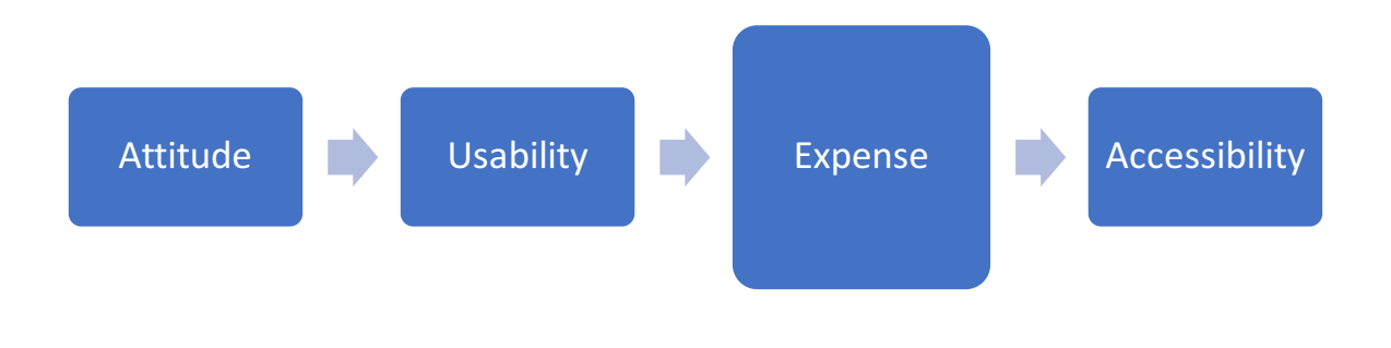
Figure 2 - Example of path for teacher where expense inhibits the part as facilitator or inhibiter

It will help to consider an example. If we were to start using a product in an educational setting, the line of action may look like this. First, the teacher's attitude towards music technology in general, or more specifically that product, company, or type of technology needs to be assessed. Given that they have a positive attitude towards this genre of music technology, they would then need to examine the usability of the product. Will it educate the students, or aid in that