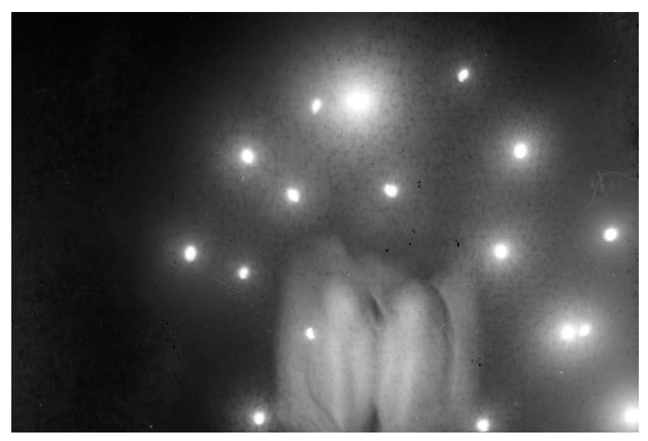
Where I've been and where I'm going 2017