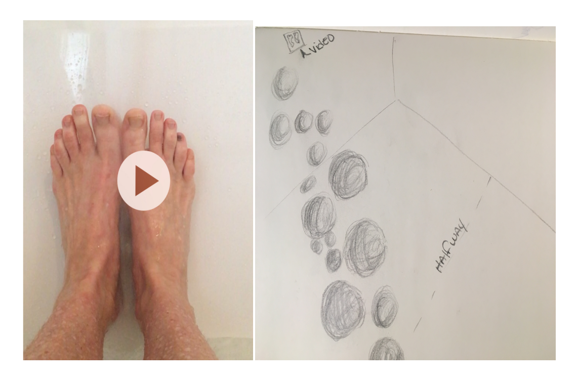
Promise to myself 2018 Video/sound installation