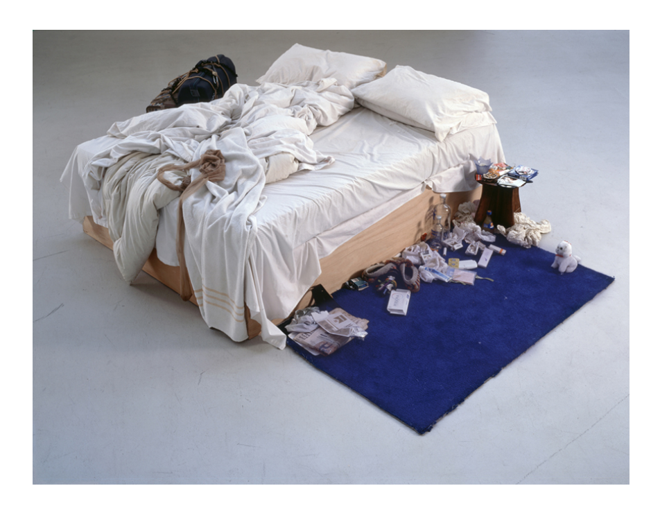
My Bed 1989

In the next chapter I will present examples of non-representational self-portraits by contemporary artists Tracey Emin, Louise Bourgeois and Catherine Opie. Their work, representing three distinctly different mediums, represents the diversity of contemporary self-portraiture. Each medium speaks a different language offering unique qualities that are capable of communicating the ineffable. Understanding how artists exploit their medium to express aspects of their identity broadens our definition of the traditional self-portrait. The works by Emin, Bourgeois and Opie have not only endowed my education in self-portraiture, they have also been the impulse, inspiration and aspiration of my creative process during the research process.