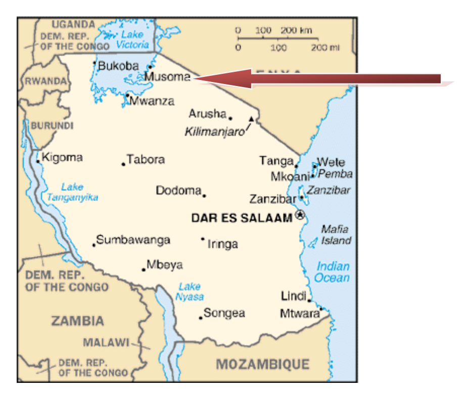
Figure 2: A map of Tanzania: Location of the study area (Musoma District)