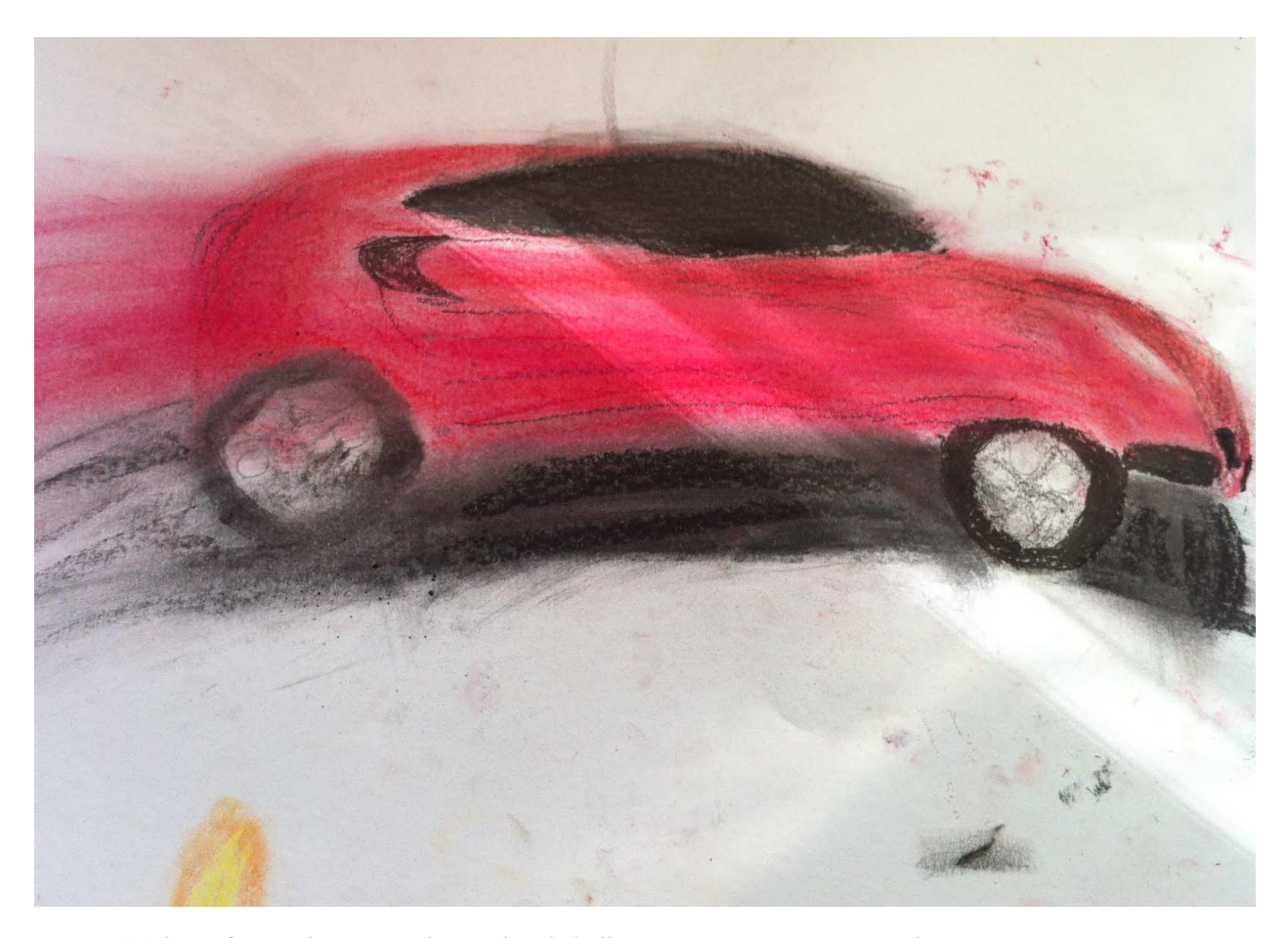
Picture 1 A large format drawing with pencil and chalk, attempting to capture speed

In arts and crafts, the 40 pupils in 5th grade alternate between textile work, metal/woodwork, and visual arts/design. Depending on the activities, the lessons may be located in the open base, but are often carried out in separate rooms in the basement. In accordance with the local curriculum, the pupils sew, knit, and make ping-pong rackets in the crafts classes, while the visual arts/design classes include activities like croquis, lino print, computer graffiti, and pictograms.