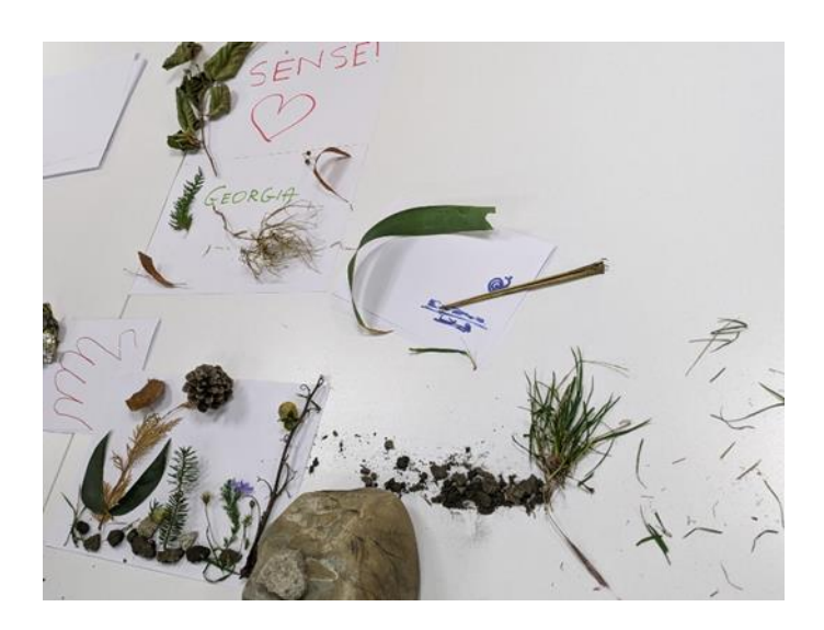
Figures 5 and 6. Touching, sounding and feeling the image