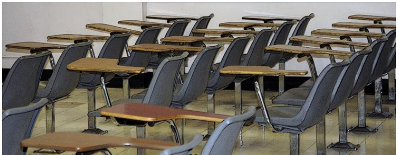
Figures 3 and 4. Car parks and school classrooms