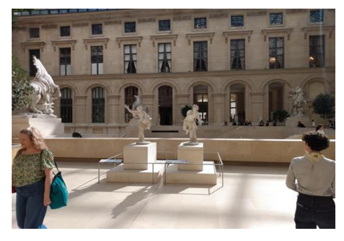
Figure 1 and 2. SENSE.STEAM project @le musée du Louvre, May 2023

This has significant implications at a time when education is called upon to educate people to live together in societies that are increasingly more unequal,