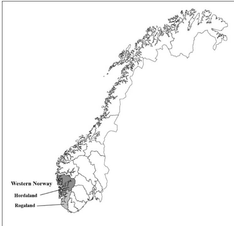
Figure 2. The case region of Western Norway.