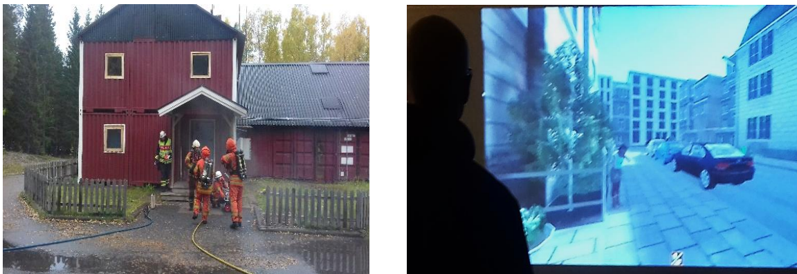
Figure 2. An IC student and four firefighters responding to the LST incident (right) and CST incident.

The scenario identified for this study was a house fire (see Figure 2). A similar CST scenario was constructed based on the observations of the LST and the interviews but also included a few new experiences. These new experiences were systematically handled (observed, discussed) in the following CST.