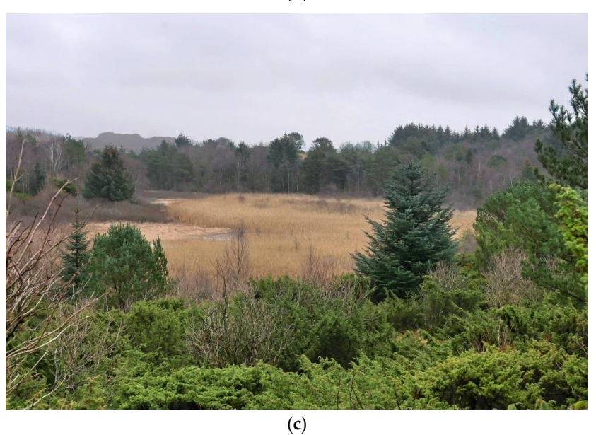
Figure 1. Extreme successional development from ( a ) 1975, ( b ) 1993 to ( c ) 2019 at Bygnes, Karmøy, Norway (N 59.298, E 5.295). (Photos by Arnt Kvinnesland. Reproduced with permission).