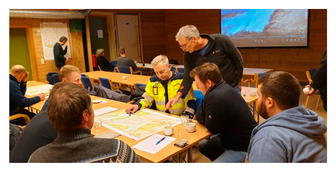
Figure 4. Participants at a January 2020 prescribed burning meeting studying maps for planning local burning sessions when the weather would allow for safe and efficient burning.

Summarizing, the winter meetings play a crucial role in the functioning of the group. Planning of the next season is the main goal, see Figure 4, but elements of a course in prescribed burning are included. Experience from the previous season is shared, and some incidents/near misses are analyzed and evaluated. However, time delays of several months may diminish the learning potential.