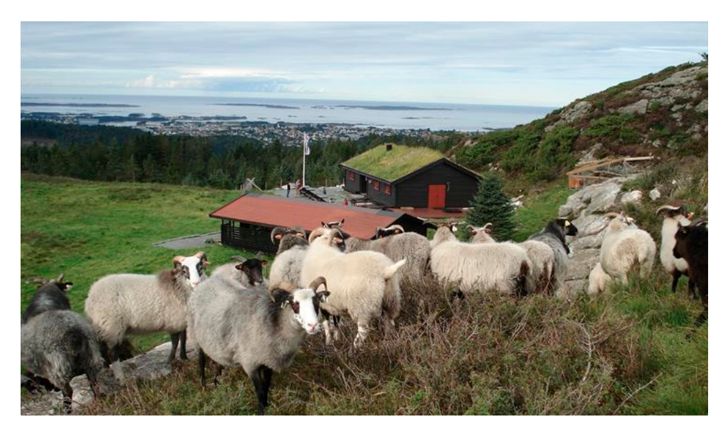
Figure 3. Kringsjå Old Norse Sheep, Haugesund, Norway.

(iii) Media coverage of a wildfire (Hetlandsbrannen) in April 2019, which started as a prescribed burn, was mostly factual, as the fire brigades and prescribed burners together fought to control the flames. Interaction between wind direction, speed and local topography created surprises, for example, fire moving north, in spite of wind forecasted from the north [58]. There is not even subtle accusation for the incident, which threatened some huts, and destroyed an electricity transformer station. The issue was followed up with a new article a couple of days later (the 15th of April) [59], with an interview of one of the most experienced prescribed burners in the area. The article mainly stresses the fact that judicious burning cannot always guarantee control. An overview of the state of the heathlands in Haugalandet is also given. It stresses that if the estimated remaining 100,000 acres is to be managed with burning each 10th year, the yearly burned area must, more or less, double what the civic group has burned on average during each of the recent years, i.e., 4000–5000 acres.