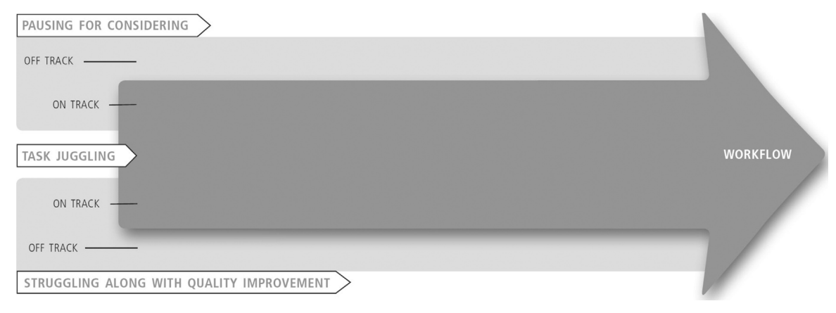
Fig. 2. The interrelationship between the three strategies of "keeping on track": task juggling, pausing for considering and struggling along with quality improvement.

uses the theory for further analyses, the theory could be modified based on new data.