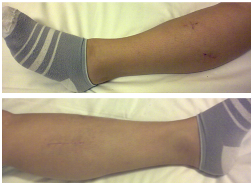
Figure 2. Photo of patient’s legs. During surgery, symmetrical skin incisions were performed in the right and left legs. On the left leg, the three scars have been colored for better visualization. The fascias were split by distances of ~20 cm in the anterior, lateral and superficial posterior compartments, whereas the fascias of the deep posterior compartments were split by distances of ~10 cm.

Pain drawing has proven of value in discriminating a radicular pain caused by the L5-or S1-nerve roots from leg pain caused by CCS and possibly its referred pain to the trochanter and lumbar region, sometimes even up to the scapula. A closer look at this patient’s pain drawing (Fig. 1) shows that its character is by far exceeding the radicular pattern usually seen in sciatica. Clinically, one needs to discriminate the pain in the anterior part of the leg caused by irritation of a L5-nerve root from the pain caused by an anterior CCS and correspondingly by the other compartments. Recently clinical examination proved more adequate